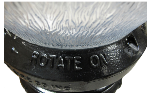
STEP 6: PLACE THE LED CONVERSION KIT GLOBE ON THE CAPITAL AND ROTOLOCK™ IT INTO PLACE OR ENGAGE THE SET SCREWS IF A NON ROTOLOCK™ GLOBE IS PROVIDED