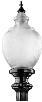
STEP 1: DETERMINE THE HID FIXTURE YOU WISH TO CONVERT TO LED