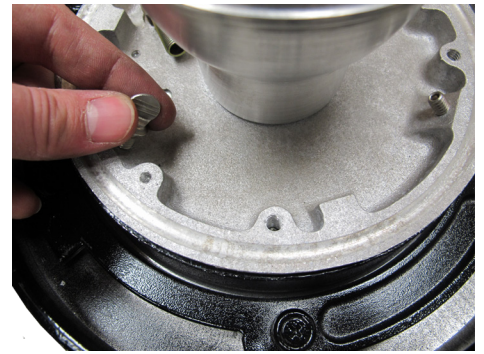
STEP 3: REMOVE THE BALLAST PLATE AND ASSEMBLY FROM THE HID FIXTURE